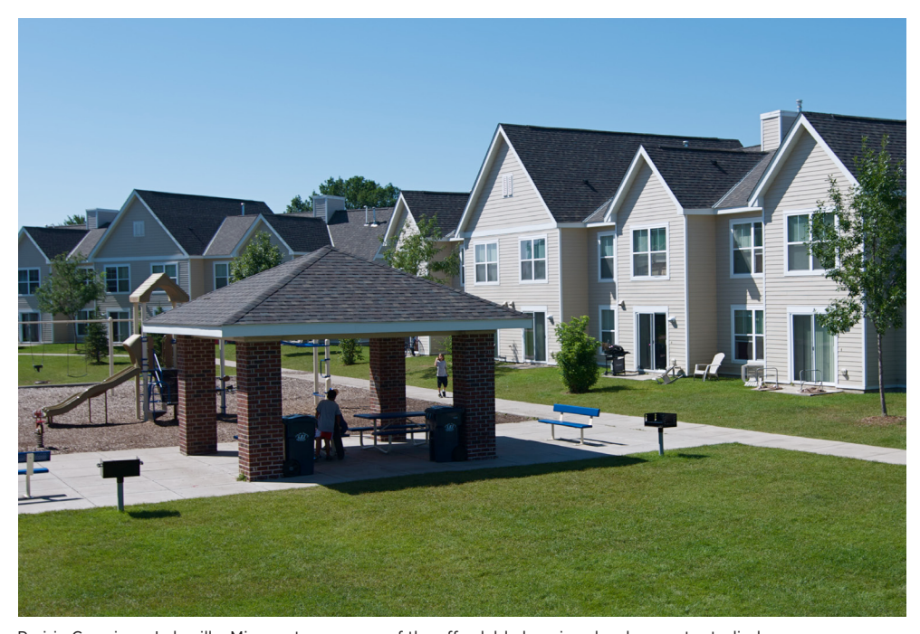
Prairie Crossings, Lakeville, Minnesota, was one of the affordable housing developments studied.

For more information about the Family Housing Fund and/or to view other publications available in this series, please visit www.fhfund.org.